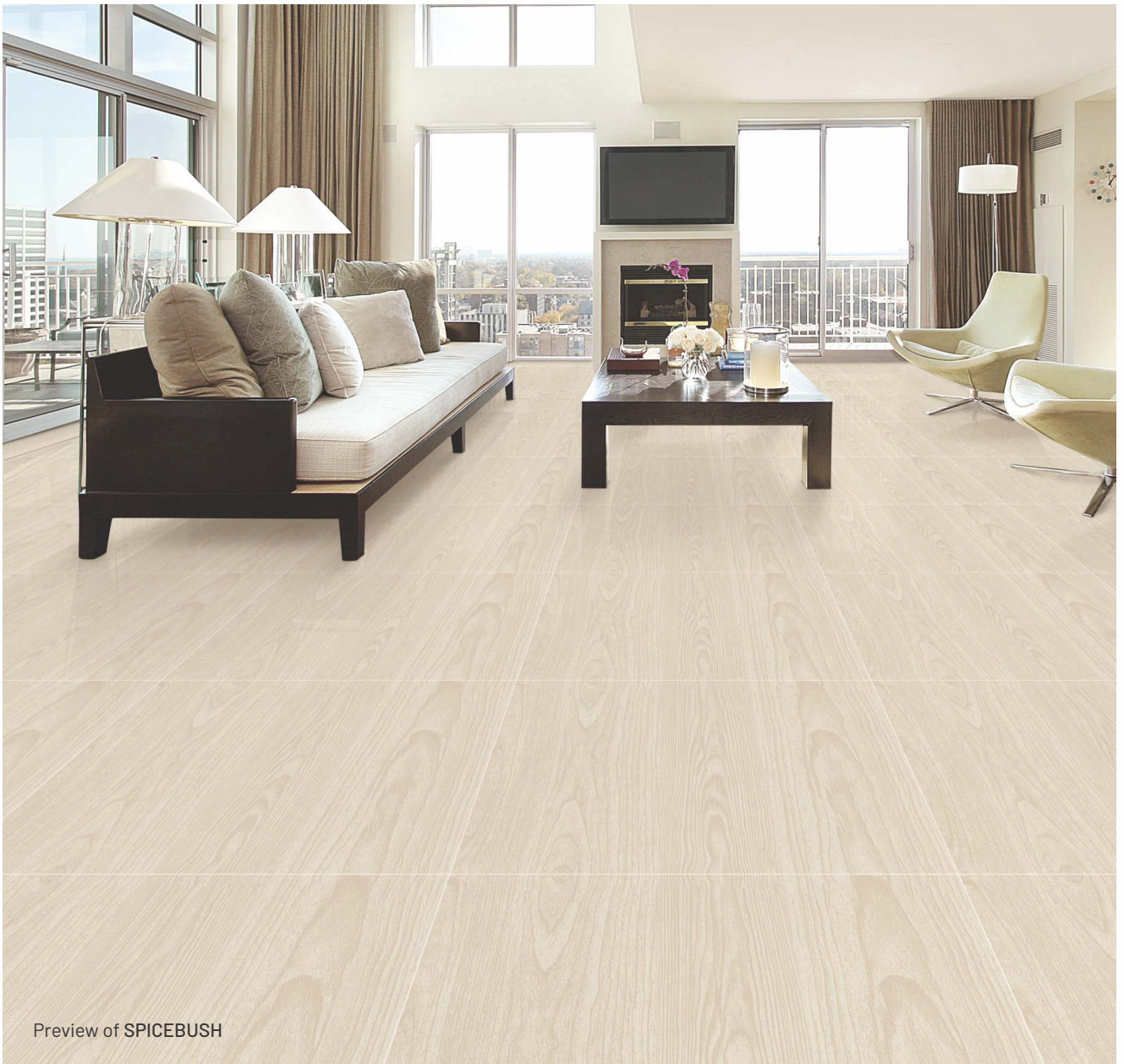
Preview of SPICEBUSH