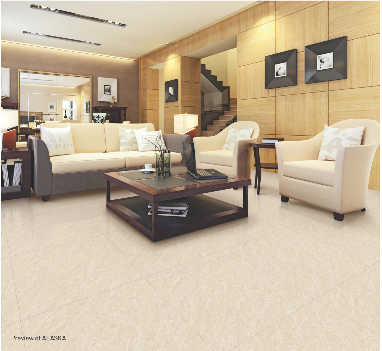
Preview of ALASKA