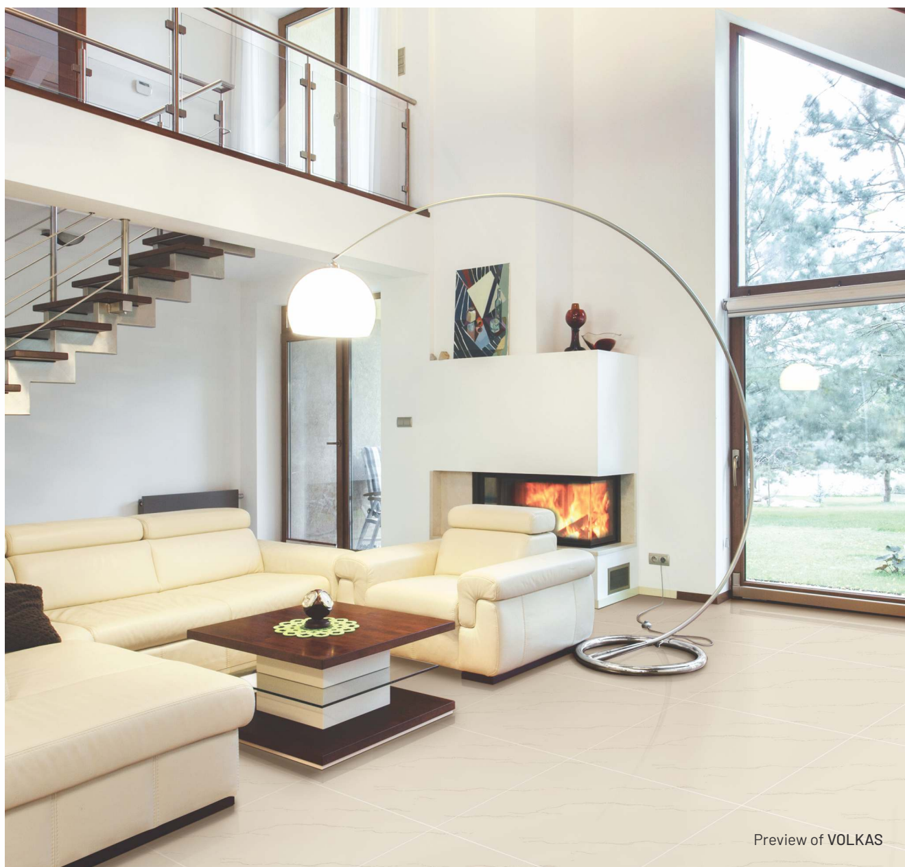
Preview of VOLKAS