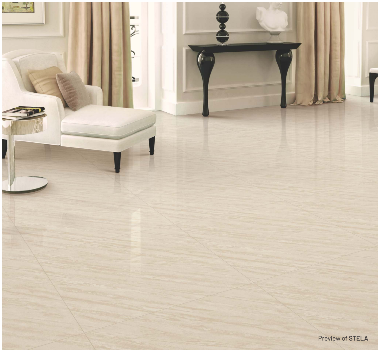
Preview of STELA